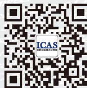
Focus on ICAS WeChat platform

Add: Room 801, HuaDing Mansion, 2368# West Zhongshan Rd., Xuhui District, Shanghai, China, 200235